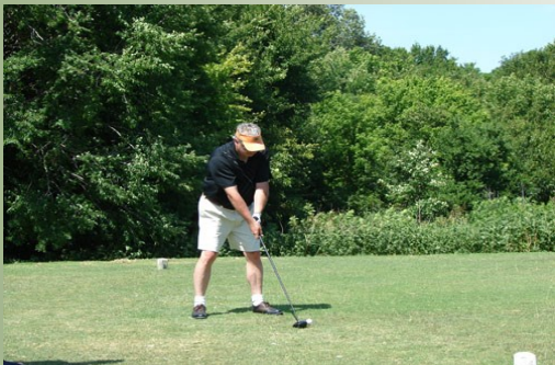
Longest Drive—Win a Driver