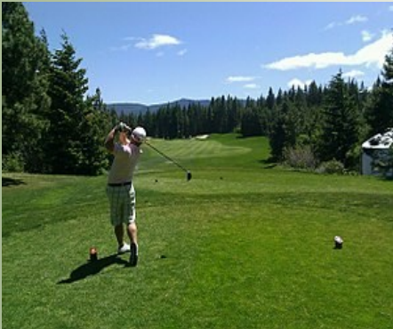
Longest Putt (60') - Win $2,500