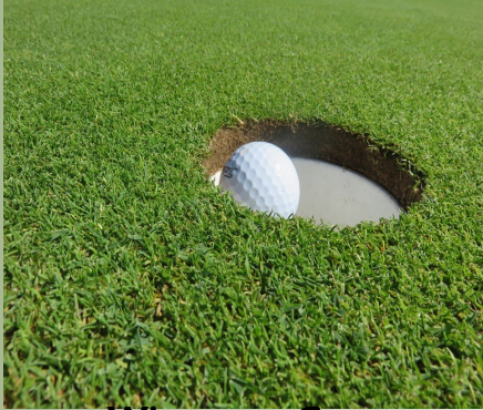
Win a new Car